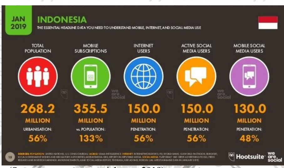
Figure 1.2 Indonesian Digital Growth