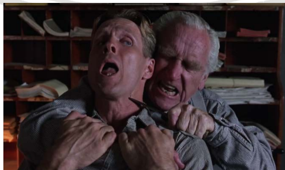
Figure 3.7 It shows Brooks intent to kill Heywood

Andy is a good mediator, with his words Andy succeeded to restrain Brooks who is about to kill Heywood. It happens when Brooks gets his parole's come true, Heywood comes to him and says farwell then suddenly Brooks puts a knife into Heywood's neck. As it is depicted in the picture below :