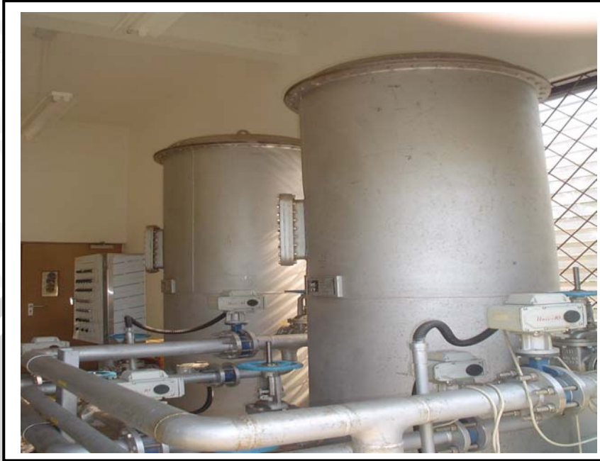
Up Flow Filter