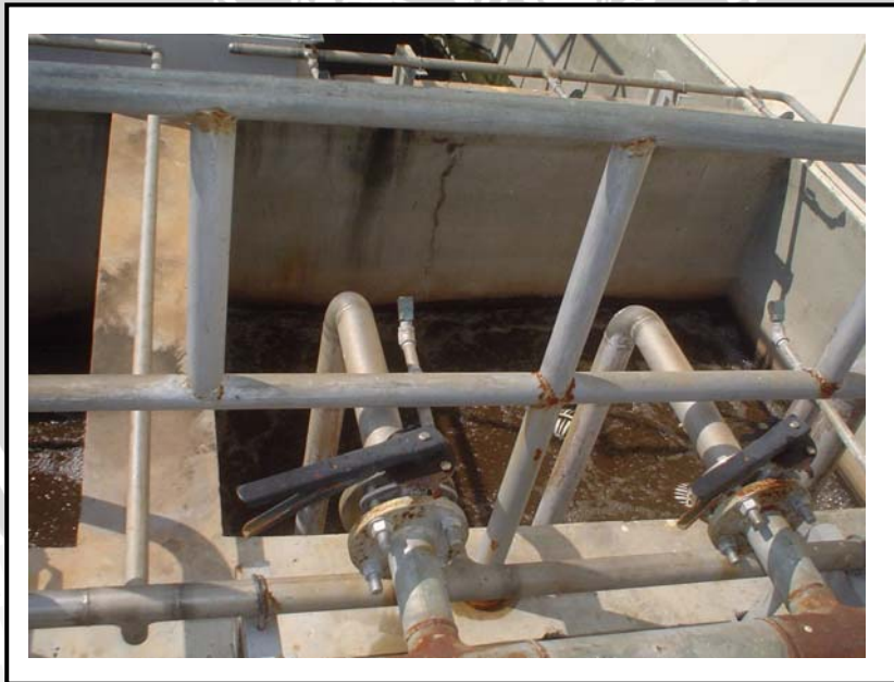
Bak FBBR 1