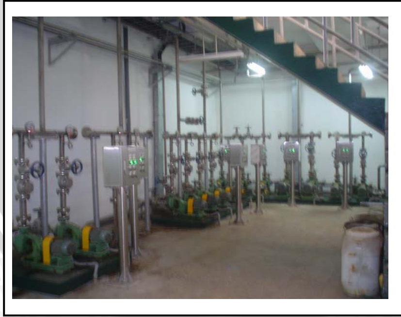
Ruang Mesin dan Pompa