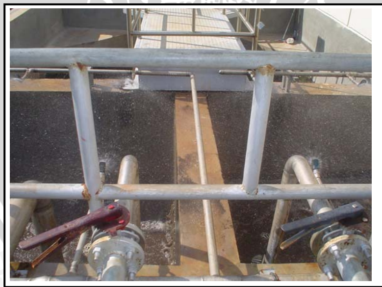
Bak FBBR kondisi spray menyala