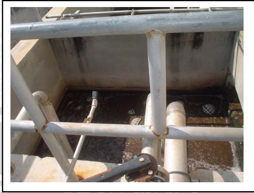
Bak FBBR 2