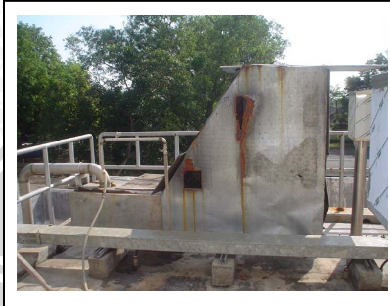
Auto Rake Screen