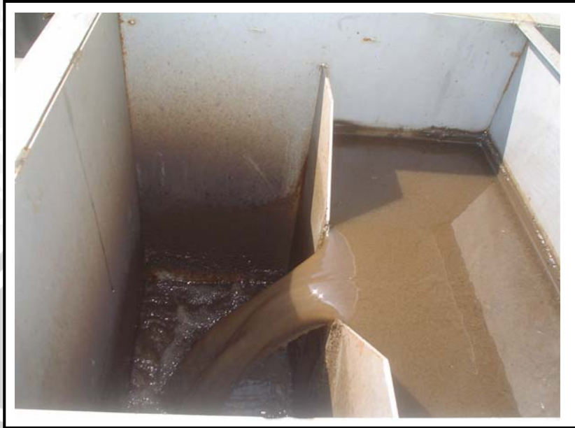
Alat Ukur Thompson