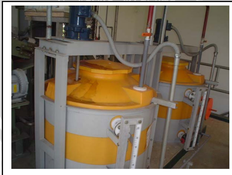
Bak Air Terolah