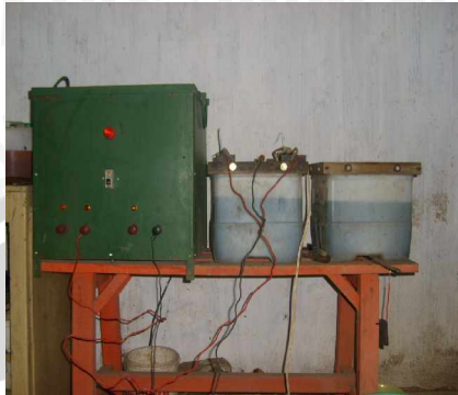
Foto Instalasi proses nickel electroplating