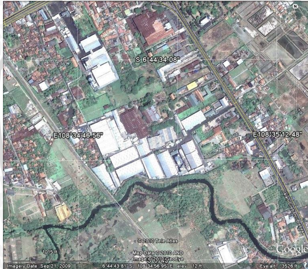
Lampiran 2. Denah Lokasi Penelitian