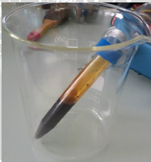
Ekstrak flavonoid buah mahkota dewa ( Phaleria macrocarpa )