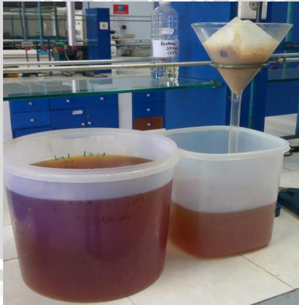
Proses penyaringan ekstrak