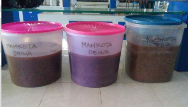
Proses perendaman ekstrak