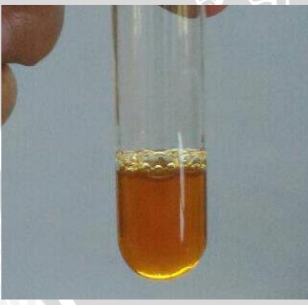
Alkaloid Wagner (-)