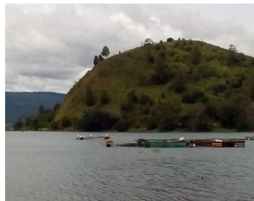
Lokasi pengambilan sampel jauh dari KJA