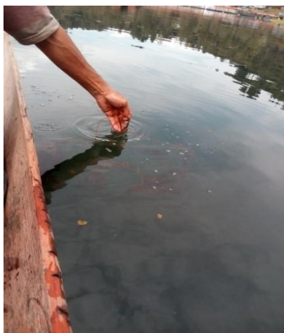
Pengoperasian alat tangkap bubu( Hauling ) bubu ( setting )