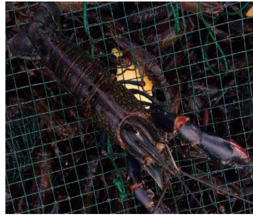
Cherax sp ( black thunder ).