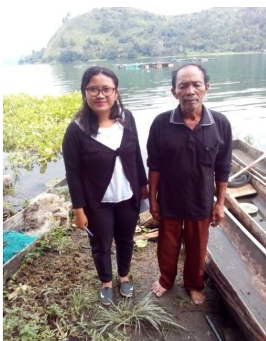
Foto dengan Nelayan