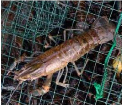
Cheraxquadricarinatus (Red Claw ).