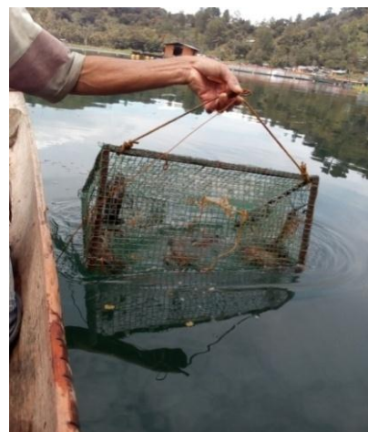
Pengoperasian alat tangkap