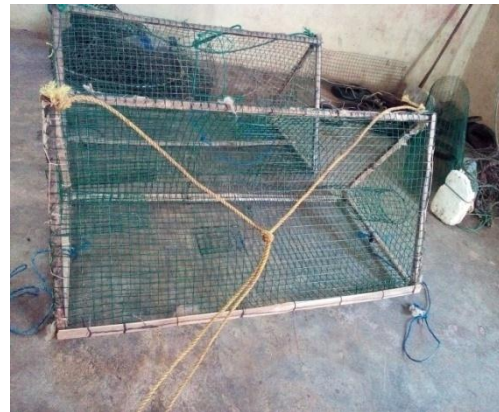
Alat tangkap bubu