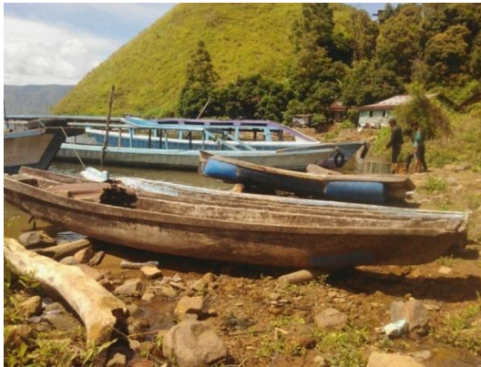
Armada Penangkapan (perahu dayung)