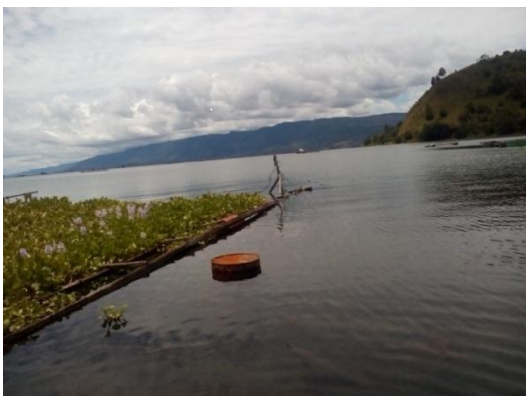
Lokasi pengambilan sampel dekat KJA