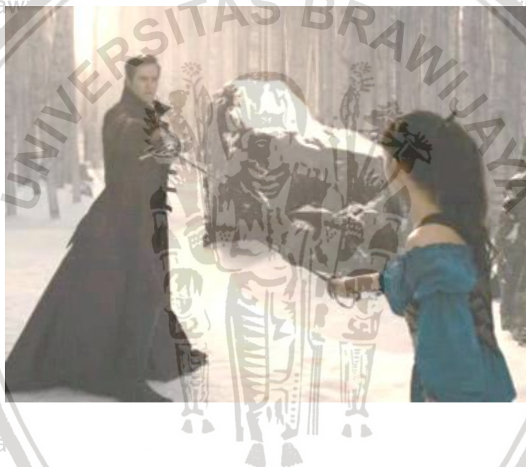
Figure 8 Snow White fight kingdom's soldier

Another difference shown by Snow White is Snow White is a strong and brave character. In this movie Snow White changes her image from the weak one become a strong girl. Snow White can make a decision to solve her own problem and fix her society problems. She wants to repair the condition of the kingdom.