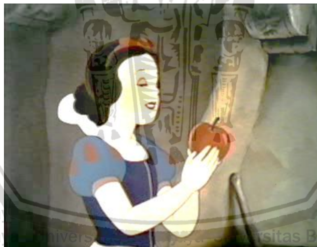
Figure 12 Snow White Trapped by the Queen

The Queen with her high expectation asks the mirror, wish to hear that she will be the fairest. However, surprisingly the mirror tells that Snow White still alive and is still the fairest on the land. Knowing from the mirror that Snow White is still alive and is still the fairest lady of the land, The Queen then makes a poisoned red apple. She comes to the forest to attack Snow White by giving her the apple. After taking a bite of the apple, Snow collapses and dying. The apple casted with a magic spell which can make Snow White sleeps to die.