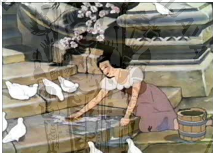
Figure 6 Old Snow White

Snow White : Make a wish into the well. That's all you have to do. And if you hear it echoing, Your wish will soon come true, I'm wishing I'm wishing For the one I love... To find me... To find me... Today... Today... I'm hoping... And I'm dreaming of... The nice things... The nice things... He'll say... He'll say... I'm wishing... For the one I love... To find me... To find me... Today... Today ( Snow White and the Seven Dwarfs , min 00:04:19)