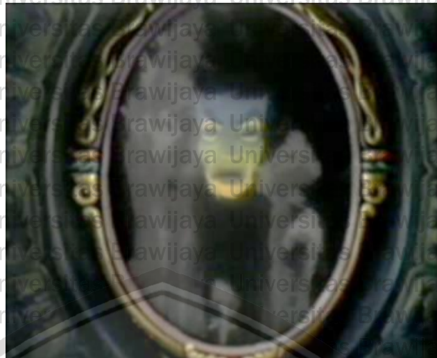
Figure 1 Magic Mirror

Queen : Magic Mirror on the wall, who is the fairest one of all?