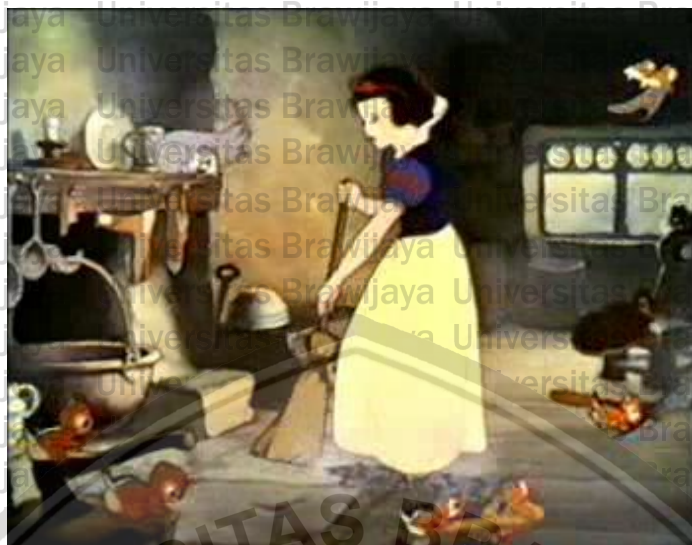
Figure 13 Snow White Takes Care Dwarfs' House

In the picture can it be seen that the image of women was only doing the household chores, or the domestic jobs. They don't need to work outside all they have to do is handling the household. Furthermore, Sugiharti and Trisakti in the book Konsep dan Penelitian Gender (2001, p12) wrote