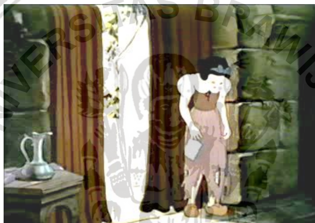
Figure 14 Snow White in tattered tan dress

While he on the way to hunts into the woods, he found Snow White singing behind the well. He found Snow White wears her tattered tan.