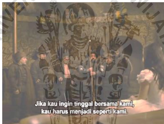
Figure 16 Seven Petite Men allowed Snow White lives in their house

Firstly the seven petite men do not allow Snow White to live in their house, because they realize that Snow White is a threat for them, however, they teach Snow White to be ready for Queen Clementianna's attack. Snow White has to learn from the petite men how to fight if she wants to live in their house. Snow White changes her performance and trains her ability to fight against Queen Clementianna.