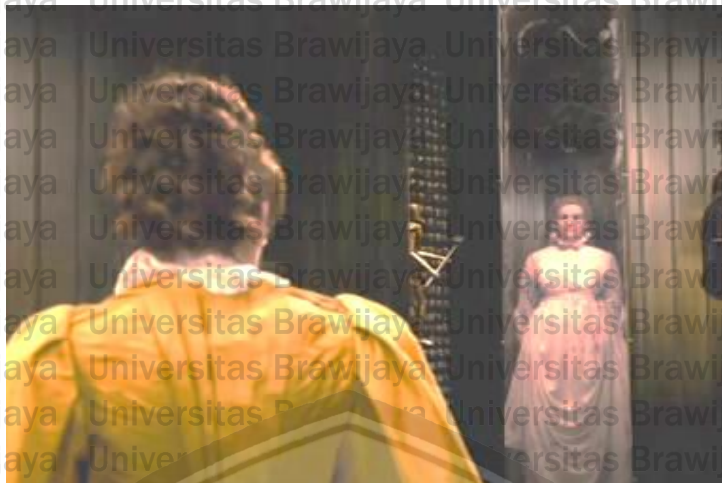
Figure 11 Queen Clementianna's Magic Mirror

Queen : Mirror mirror on the wall... Can you believe that Baron? You really think I would consider in marrying him? We all have standards, and an exotic woman like myself, have very high standards.