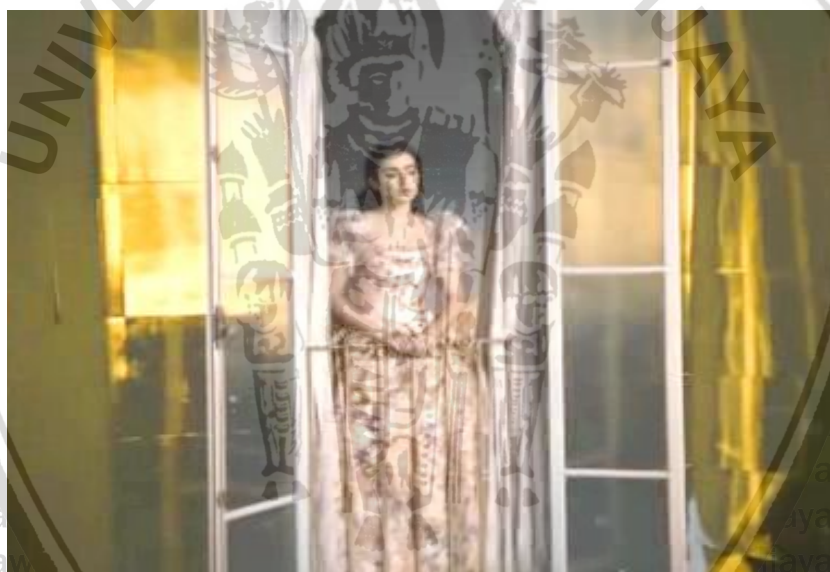
Figure 7 New Snow White

It was different with Snow White's characteristic in Mirror Mirror movie. The different character of Snow White also can be seen from the image of Snow White. Snow White in Mirror Mirror is not doing household jobs. She wears a beautiful gown and act like a princess. She watches her walks, her voice, and her attitude. It can be concluded that the new Snow White image