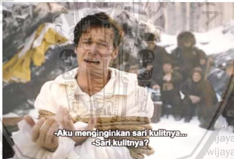
Figure 10 Prince Alcott

Prince Alcott's other weakness is shown when he is trapped and casted by Queen Clementianna. Queen Clementianna casts Prince Alcott and makes he loves the Queen very much.