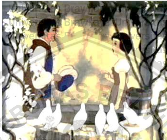
Figure 2 Prince met Snow White

He is a good singer too, he can sing with Snow White in some scenes. He loves Snow White from their first sight. The prince character in this movie has a perfect characterization, he is figured as a handsome, brave and respectable man.