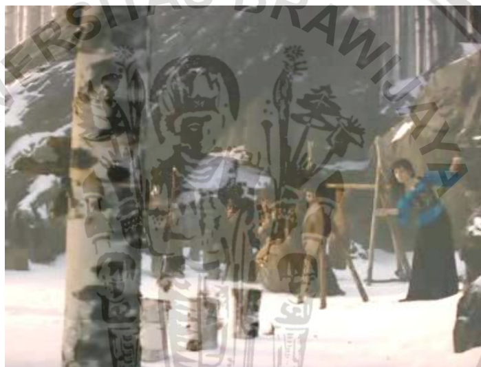
Figure 5 Seven Petite Men Teach Snow White

They live together in the woods and become a thief. They steal goods, money, and food from anybody who travel in the woods.