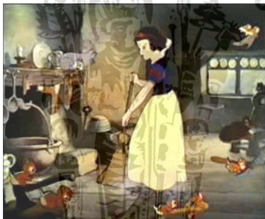
Figure 4 Snow White

Snow White knows if the kingdom should belong to her, but she let the Queen to take all she has. She does nothing to stop the queen. In her singing, snow white wishes that someday a prince will come to save her.