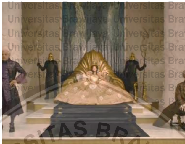
Figure 9 Queen Clementianna

Queen Clementianna also hates Snow White, she never allow Snow to walk out of her room.