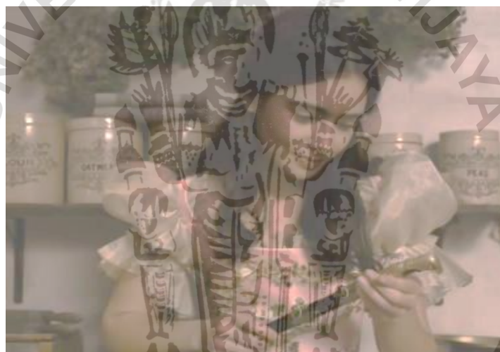
Figure 15 Snow White handling her father's dagger

Margaret : Do you know why I keep working for the unpleasant queen year after year? This because one day you will rule the kingdom. And I want to be here when that happens.