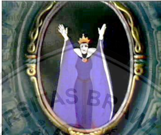
Figure 3 The Queen

which can tell her who she is. The Queen has magic skill too, she can make some black magic spells to make her wish. Those all means she can do everything to get what she wants.