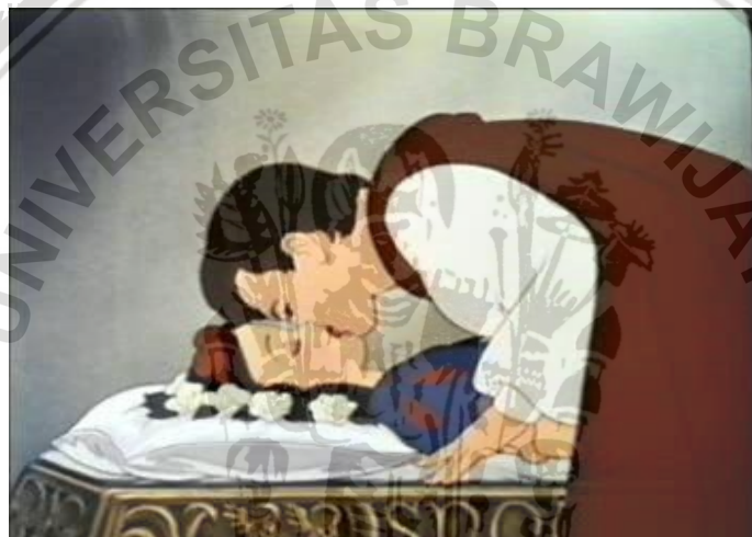
Figure 17 Prince Kisses Snow White

The Prince in both movies is an important character. The changing of gender position shows from the different prince character in both movies. In Snow White and the Seven Dwarfs movie, the prince is characterized as the helper for Snow White, he kisses Snow to break the Queen's cast.