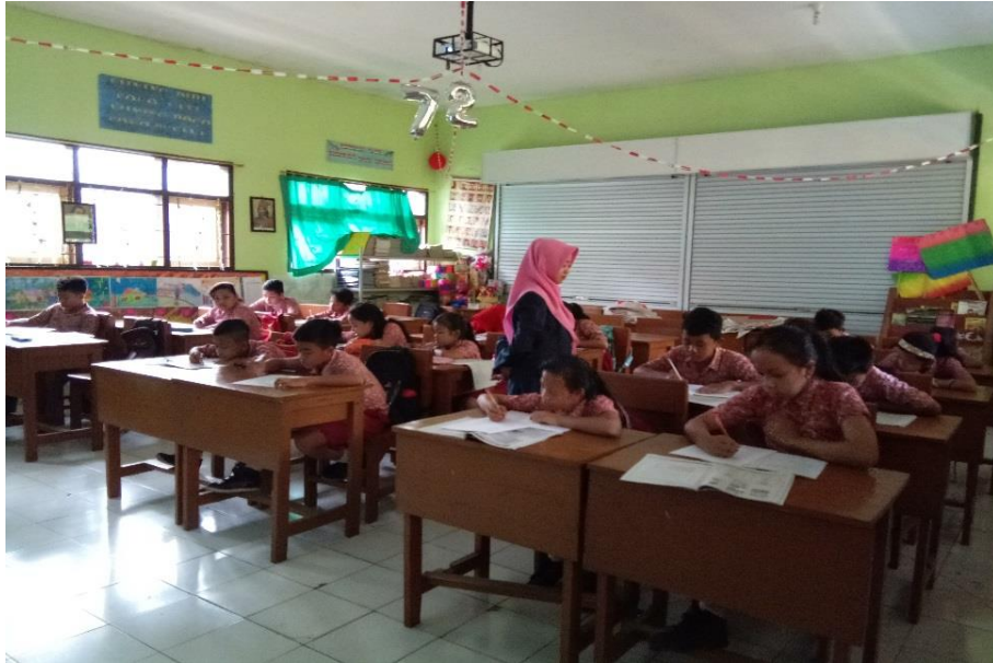
The researcher checked of each group