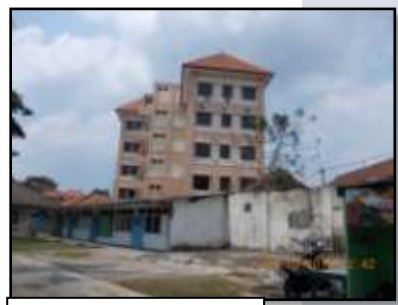
B. Pavilion RSSA