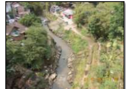
F. Sungai Brantas