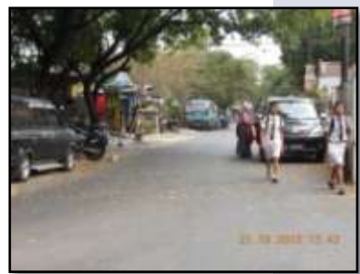
C. Jalan Kahuripan