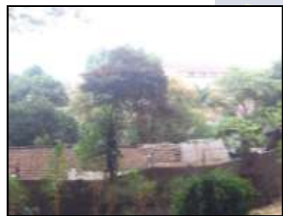
A. Permukiman Penduduk