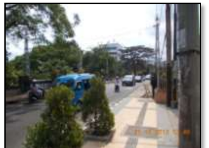
E. Jembatan Kahuripan