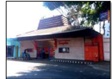
D. Gerbang utama