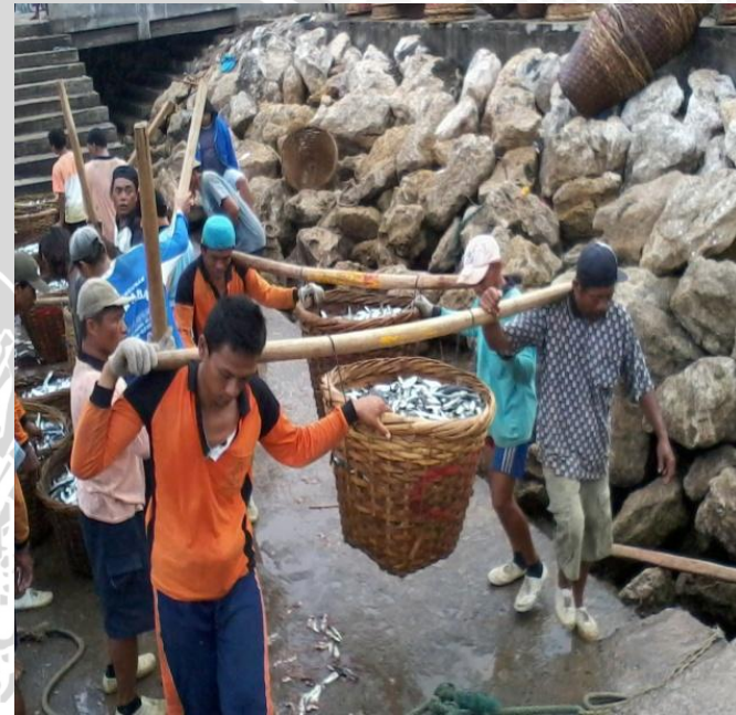
Kegiatan Pengangkutan Ikan Dari Kapal Ke TPI