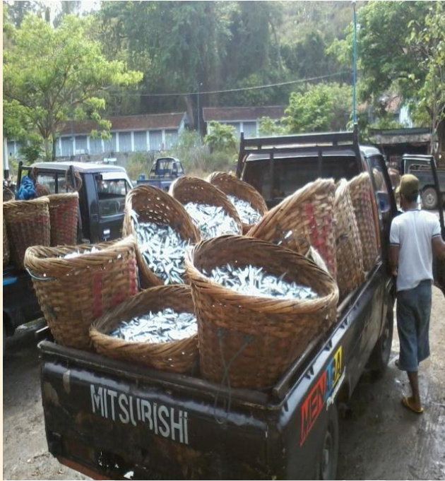
Kegiatan Pengangkutan Ikan Dari TPI Ke Tengkulak