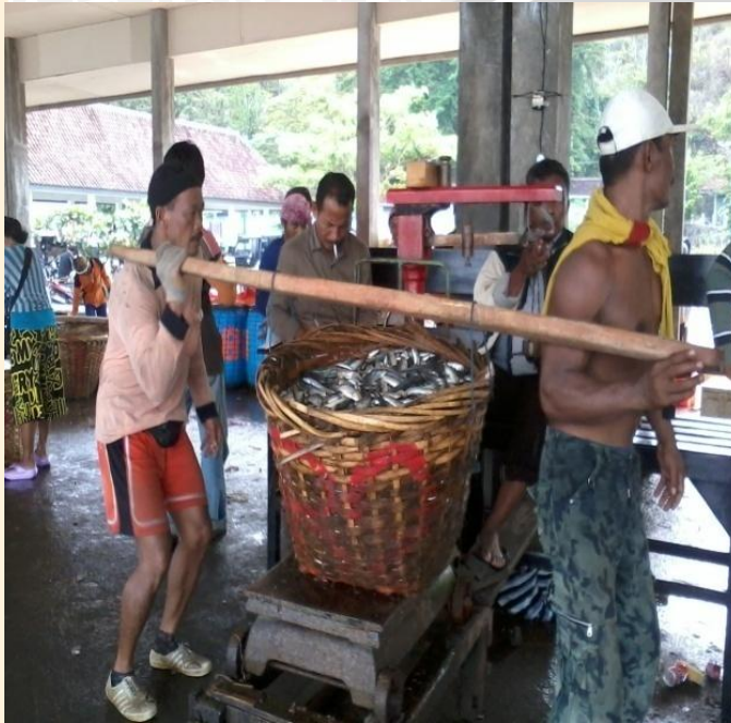
Kegiatan Proses Penimbangan