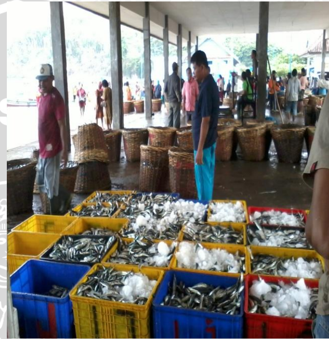
Kegiatan Proses Pendinginan Ikan