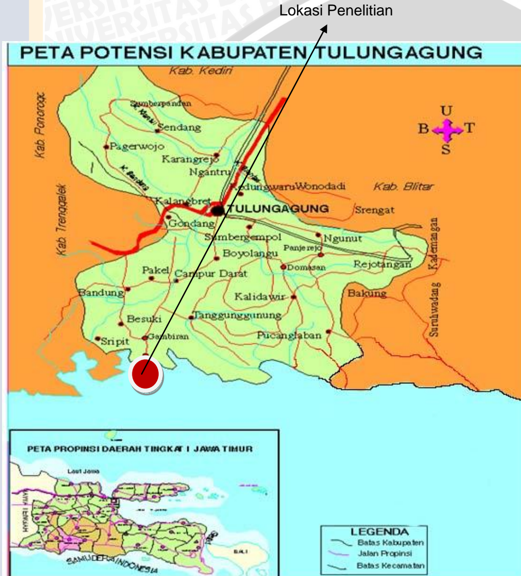
Lampiran 4. Denah Lokasi Penelitian pantai popoh