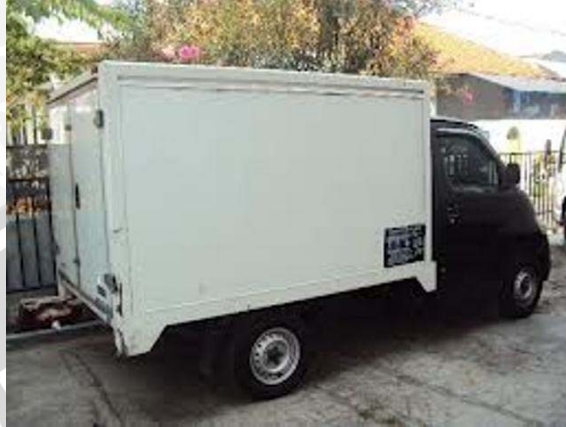
Alat Transportasi Pemasok