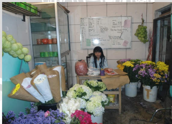
Tempat Penyimpanan Bunga Potong Krisan