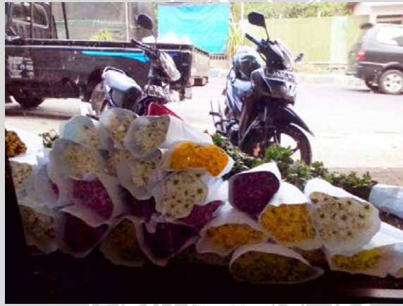
Pengemasan Bunga Potong Krisan