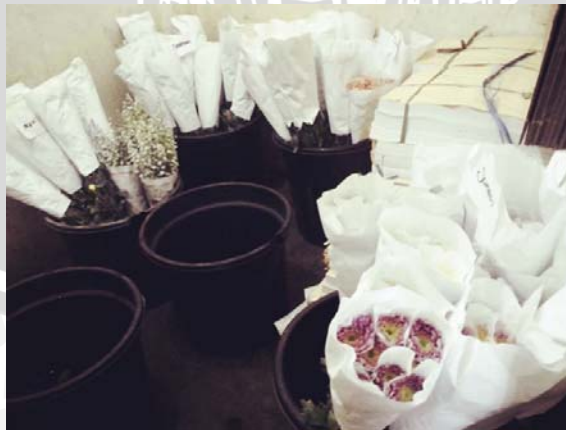
Tempat Penyimpanan Bunga Potong Krisan