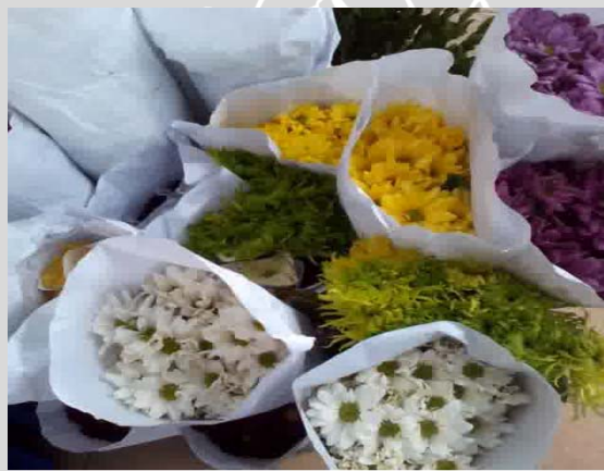
Pengemasan Bunga Potong Krisan