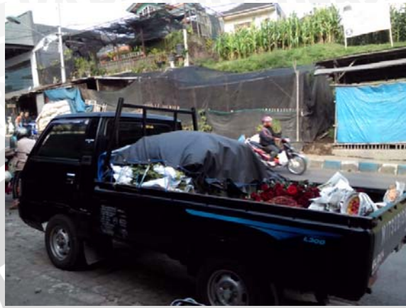
Alat Transportasi Pemasok