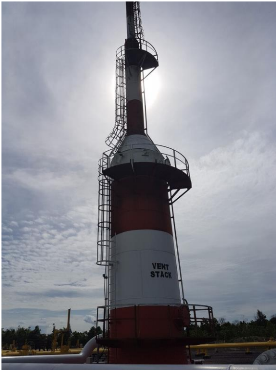
Lampiran 4 : Foto Dokumentasi