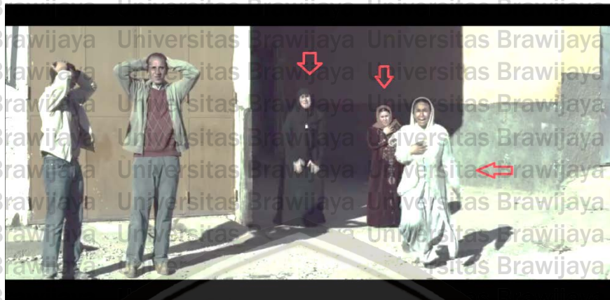
Figure 3.6 Picture of Iraqi women.