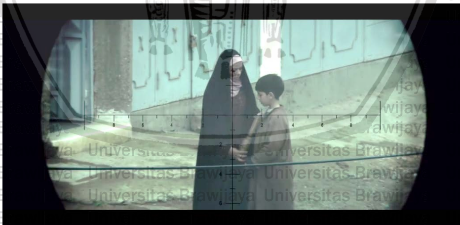
Figure 3.9 The Woman hand the grenade off to the young boy.

Thirdly, the Orient degenerates. According to Said (1978, p.40) The Orientals are fixed with stereotypes: cowardliness, laziness, untrustworthiness, fickleness, laxity, violence and lust. American Sniper movie illustrates the aspect of degenerate through the woman and the young boy attitude. In the movie the scene begins with a woman and a young boy appear in the doorway of the same building and walk toward the convoy. As portrayed in figure 3.9, Kyle reports the woman and boy, noting that the woman is not swinging her arms as she walks and appears to be carrying something. No one in the convoy can see it to confirm. He watches through the scope as the woman removes something from her cloak and hands it to the boy, and he realizes that it is a grenade. He again gets the green light to shoot, but his marine guard warns him that he will be sent to prison for shooting a child, if he's wrong. As the young boy starts running toward the convoy with the grenade in his hand, Kyle pulls the trigger and kills him.