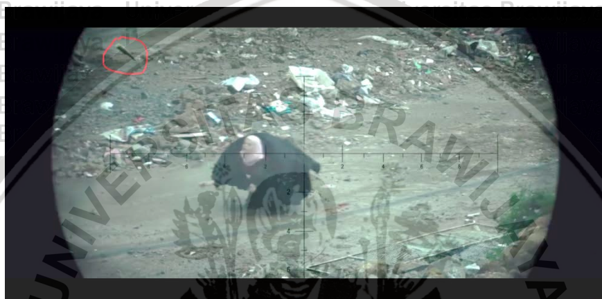
Figure 3.10 The Woman attacked U.S Marine with Russian made RKG-3 Anti-tank grenade.

The woman starts wailing and running toward the boy, and Kyle watches her closely. She runs past the boy's body to grab the grenade he dropped and continue running at the convoy. As portrayed in figure 3.10, she is about to fling the grenade falls short of the convoy and explodes, leaving the troops unharmed.