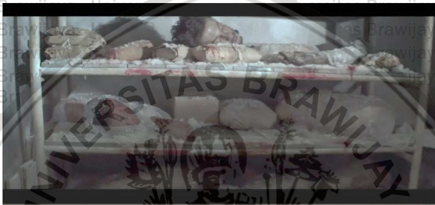
Figure 3.3 Dead bodies of American soldiers.

Another barbaric action from the Butcher can be seen from the scene when SEALs enter the building where the Butcher and his guards hiding. As portrayed in Figure 3.3, there are a lot of mutilated dead bodies of American soldiers in one room. The Butcher and his guards seems to killed the American soldier and then cut up the body parts of dead body.