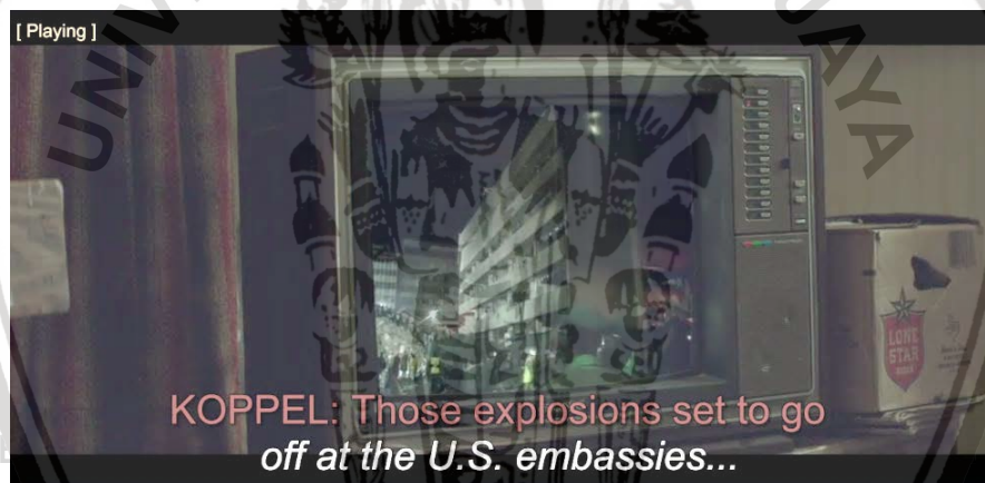
Figure 3.12 News about 9/11 accident in the U.S

Firstly, the movie represents the binary oppositions of the colonizer versus the colonized. In American Sniper , America is regarded as the Westerners who are the colonizer whereas Iraq is regarded as the Eastern land that is a place to be colonized. This sanitization of Western history and patronization and demonization of the non-West, and specifically Iraq, was extremely prevalent throughout the entire film. It paints a very black and white depiction of the Iraq War; an “us” versus “them”, “good” versus “evil” binary. There is no context provided for the war, but figure 3.12 shows exactly a scene from 9/11 of the World Trade Center collapsing being shown on the television.