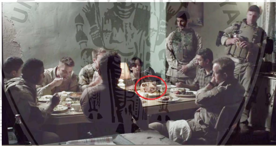
Figure 3.8 A man and his family invite the SEAL to join for a meal