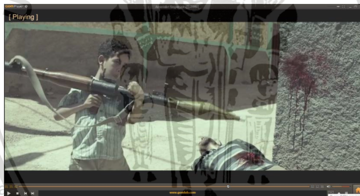
Figure 3.11 The young boy try to pick up the grenade launcher.