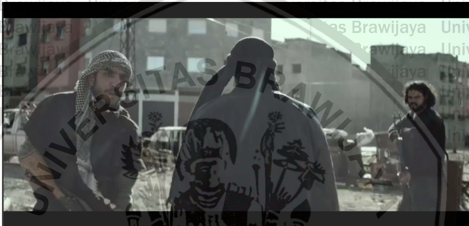
Figure 3.5 The Al Qaeda dressing in American Sniper movie

Apart from their attitude, the Butcher and his guards are demonstrated as savage through their costume. The Butcher and troops described as young with dark skin colour, maybe twenty until thirty, with a kick-boxer's build. As portrayed in figure 3.5, they wore a sorban (Islamic headscarf) and jubbah (Islamic long robe), wearing all black and also have a beard.