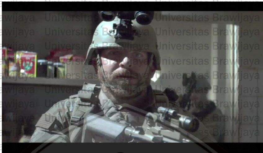
Figure 3.4 Kyle sees the corpse of American soldiers.