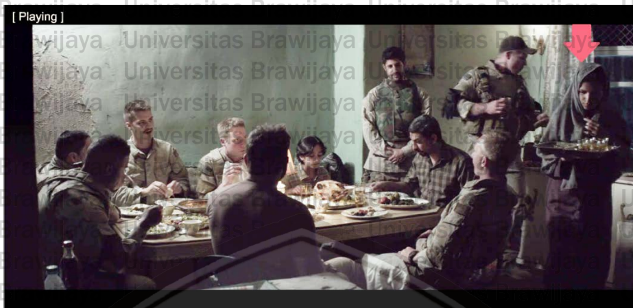
Figure 3.7 Iraqi woman serves dinner to her family and the SEALs