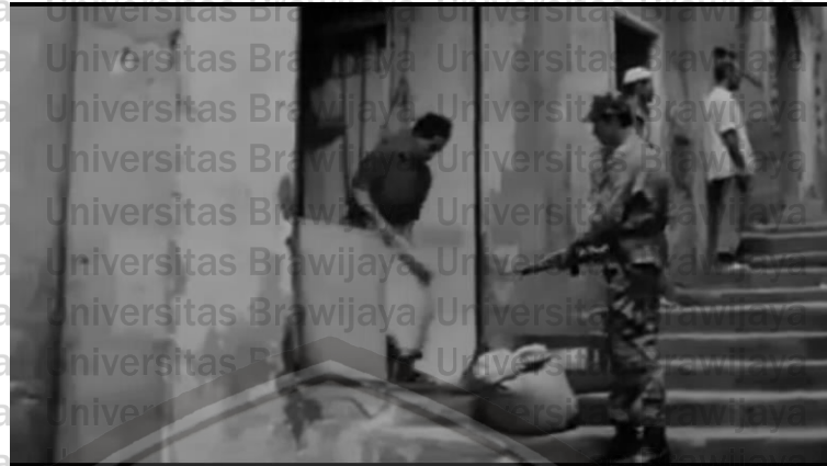
Figure 3.5.1 French army plunder all of logistic needed from Aljzair people

In this scene visible mass discrimination carried out by the French government to take all the material needs of the people of Algeria by force and inhuman. For instance, the Chinese in Indonesia together with the Arabs, India, during the Dutch Colonial East group classified as foreign, and then in the days of independence when they are all willing to recognize Indonesia as their homeland, and as well as on the state R.I. can be regarded as Indonesian citizens. (Constitution 45, Chapter X, Article 26, paragraph 1). But his treatment of them there is a difference. For those of Arab descent, because of his religion similar to that embraced ethnic majority Indonesia, they are considered "Pri" [Pribumi] or "Asli", whereas Chinese descent, because of his religion in general is Tri Dharma (Sam Kao), Budis, Nasrani. Indian Hindu descent and the Netherlands who are Christian, considered "Non Pri". With "Non Pri" The position of those who are not "pribumi", mainly of Chinese origin was once discrimination. Even by the New Order government, has issued several presidential regulation squeezing