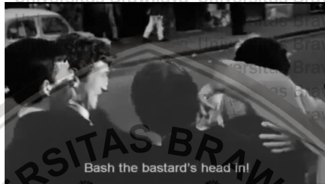
Figure 3.2 Ali was attacking by french people ( Sources : The Battle of Algier , 1964, Minute : 09 )

Necessary it is to Rely on the abilities of the players. Such directors growing niche to favor long shots, which keep the performer's entire body within the frame. A fight between Ali with the French youth seen in this scene.