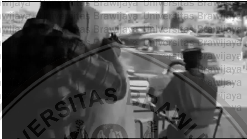
Figure 3.4.3 the women give a guns from her clothes to that man ( Sources : The Battle of Algier , 1964, Minute : 30.56 )

Mexican garb contemporaneous with the 1940's, she is also given a fake unibrow to more closely resemble the painter Frida Kahlo.