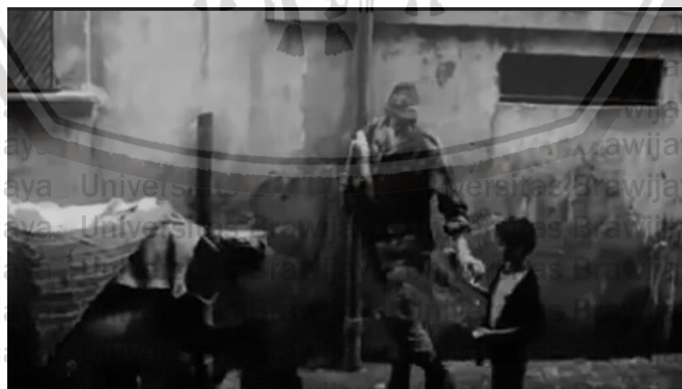
Figure 3.5.2 french army distribute the logistic for the hunger aljzair people

them, even with the political assimilation is assimilation. So as ethnicity they should not exist. To support the political very flavorful racist. By Suharto's government has issued several presidential decree as: violation School and Publishing speak Chinese; the decision of the Cabinet Presidium No. 127 / U / Kep / 12/1966 regarding Name Change; Presidential Instruction No. 14/1967, which regulates Religion, Belief, and the descendants of the Chinese Customs. Presidential Decree No.240 / 1967 regarding the main policies concerning citizen foreign descent, as well as the instructions of the Cabinet Presidium No. 37 / U / IN / 6/1967 on solving basic policy of China (Thung, 1999: 3-4). Between France and Aljzair more complex because it discriminated lead to acts of violence and coercion resulting mental and physical contact. the democratic synthesis be permanent—and it is upon that assumption alone that this analysis is valid—in the matter of rights there can be no differentiation. Government exercises power not in the interests of any party or class within the state but in the interest of the state as a whole ( Harold J laski, 15, 2000).