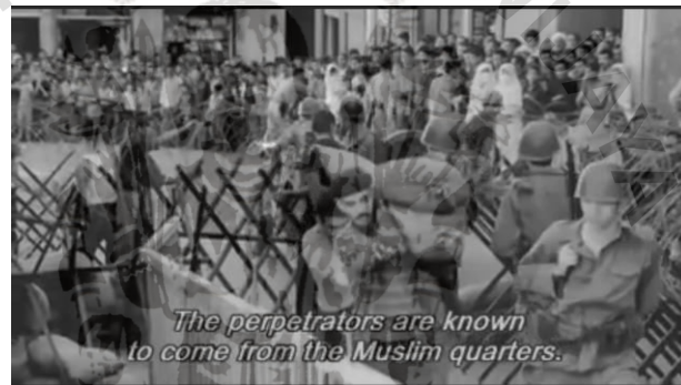
Figure 3.3.2 when the french army build the authorization for separate french and alger territory

Discrimination by relevant institutions, namely the French government looks at this scene