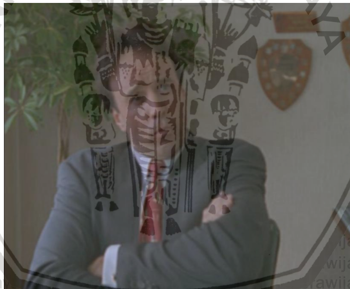
Figure 3.7 Franklin Fitz's new appearance (Source: Principal Takes A Holiday , 1998, part 1, minutes 00.27.03)

From the pictures above, we can compare how Franklin Fitz looks like before and after he meets John Scaduto. Before Fitz meets John, we can see that Franklin Fitz is a homeless man. He has long hair. Uses t-shirt and jacket, and he