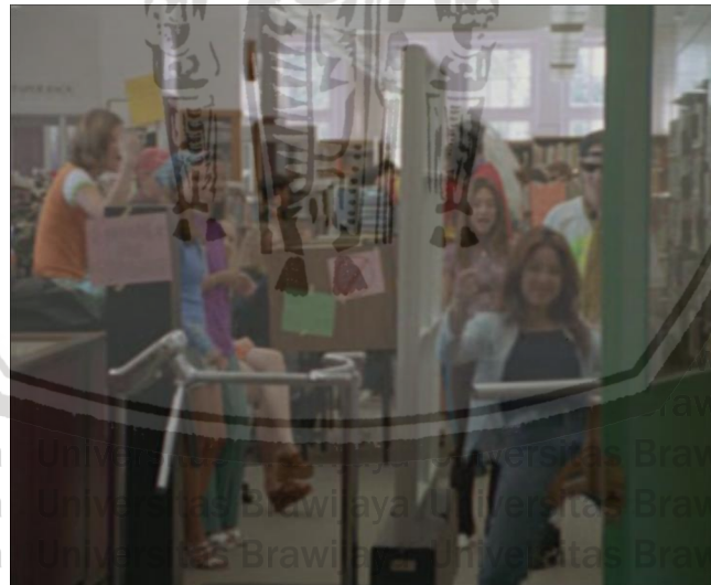
Figure 3.9 the School Condition after Fitz Erase the School's Regulation

From the dialogue above the writer can assume that Fitz thinks John Scaduto's school regulation is too formal and out of keeping with American student style in nowadays. Thus, the school becomes irregular. Not only in the studying time, but also in the break time. Fitz asks the students to do what they want to do without seeing the rules. Figure 3.9 supports more information about the school conditions after Franklin Fitz erases the school's regulation.