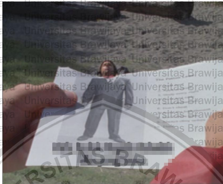
Figure 3.4 John Scaduto cast Franklin Fitz to be a principal (Source: Principal Takes A Holiday , 1998, part 1, minutes 00.19.46)

John Scaduto chooses Franklin Fitz to be Dr. Vernon Baxter because John knows that Fitz like his teacher, Ms. Celia Shine, after seeing that Franklin Fitz pay attention to Ms. Celia Shine. John thinks when Fitz becomes a principal in his school, they both can get advantages, John can go into the computer access to erase his mistakes and punishment data, and Franklin Fitz can get acquainted with Ms. Celia Shine.