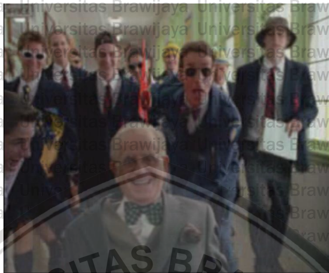
Figure 3.12 Dr. Vernon Baxter's Expression (Source: Principal Takes A Holiday, 1998 , part 2, minutes 00.32.43)

From Dr. Vernon Baxter's expression we know that he likes the changes on Patton High School. At the same time, the principal of Patton High School comes to the school and tells the truth in front of the assessor and all people. He says that Franklin Fitz is a fake Dr. Vernon Baxter, and he calls the real Dr. Vernon Baxter and asks him to say that all of this is John Scaduto's plan.