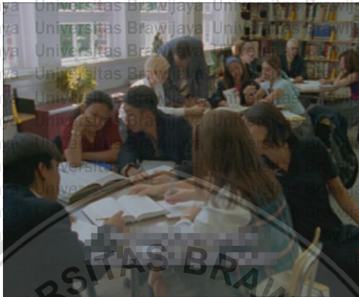
Figure 3.11 The School Condition After Fitz Realize His Mistakes (Source: Principal Takes A Holiday, 1998, part 2, minutes 00.36.05)

When the condition is better, the real Dr. Vernon Baxter comes to John Scaduto's school. Dr. Vernon Baxter see the new condition of that school, and he is shocked with the school conditions. He sees many changes in Patton High School, and he sees the new creative teaching method. Unpredictably, he really likes with the new teaching method of this school. Figure 3.12 supports more information about Dr. Vernon Baxter's joining the new teaching method in Patton High School.