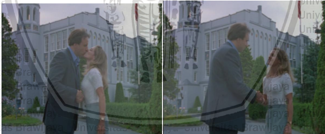
Figure 3.13 Franklin Fitz and Ms. Celia Shine's Relationship (Source: Principal Takes A Holiday , 1998, part 2, minutes 00:38:32)

When Ms. Celia Shine feels disappointed because Franklin Fitz lies to her, Fitz asks John Scaduto to say his sorry to Ms. Celia Shine before Ms. Celia Shine goes to her second assessment. Figure 3.13 supports more information about Franklin Fitz and Ms. Celia Shine relationship after the school condition is better.