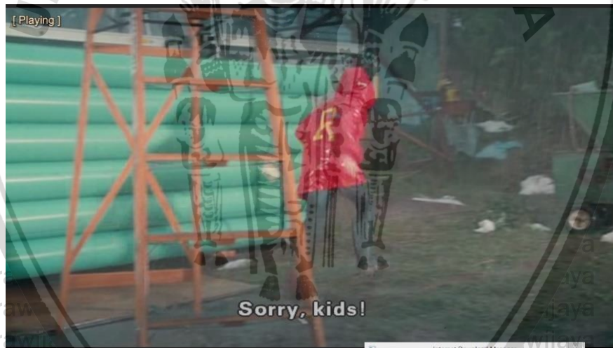
Figure 3.1.7 Running away to avoid Mrs. Irvine.

After Greg Heffley says “yes” to Mrs. Irvine, he suddenly runs away and leaves the kindergarteners to avoid Mrs. Irvine who walks in rush to him. We can see from figure 3.1.7 below.