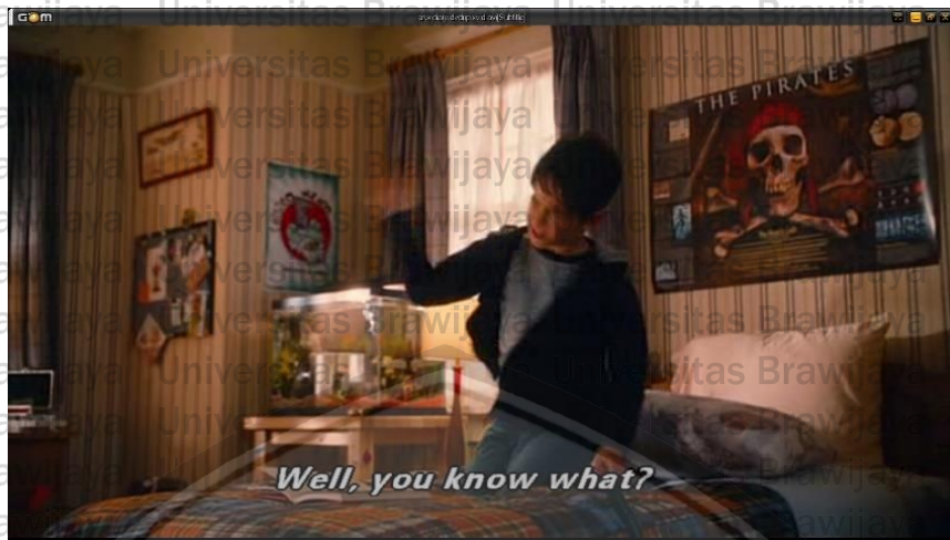
Figure 3.3.1 Releasing his anger by throwing his pencil.