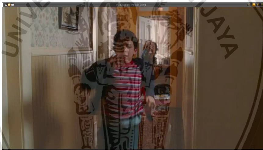
Figure 3.1.5 Running away from Fregley.

In this dialogue, Greg Heffley tries to keep away from Fregley by saying “Get away from me!” when Fregley directs his forefinger with his dried snot sticks on it. Then, Greg Heffley runs away. We can see from figure 3.1.5 below.