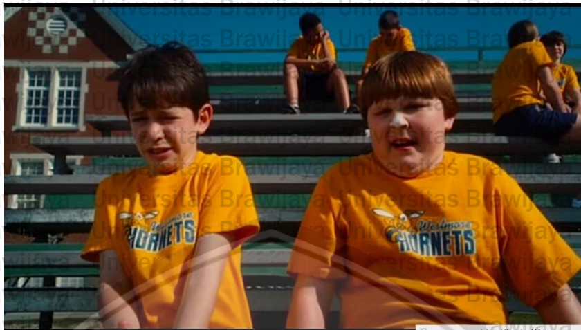
Figure 3.1.2 Avoiding Fregley's Freckle by furrowing his face and slanting his eyes.