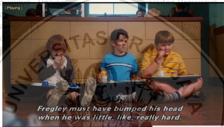
Figure 3.1.4 To not seeing Fregley's snot by moving closer to Rowley Jefferson and turning his head.

(Source: Diary of a Wimpy Kid , 2010, minute 00:16:15)