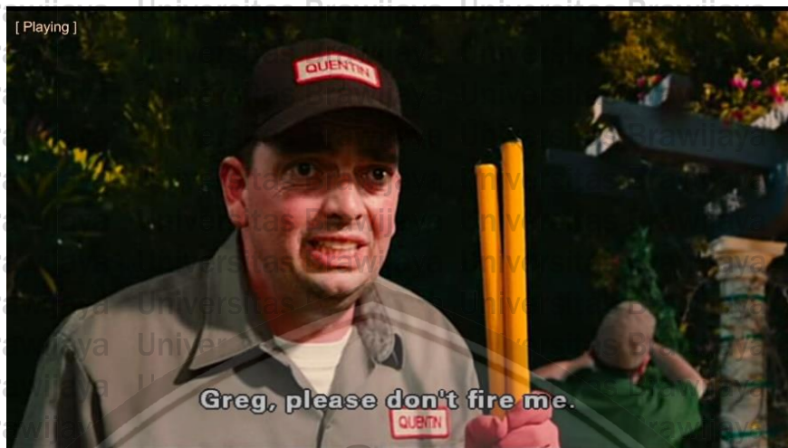
Figure 3.1.6 Imagining that Quentin is Greg Heffley's low servant.

(Source: Diary of a Wimpy Kid , 2010, minute 00:17:09)