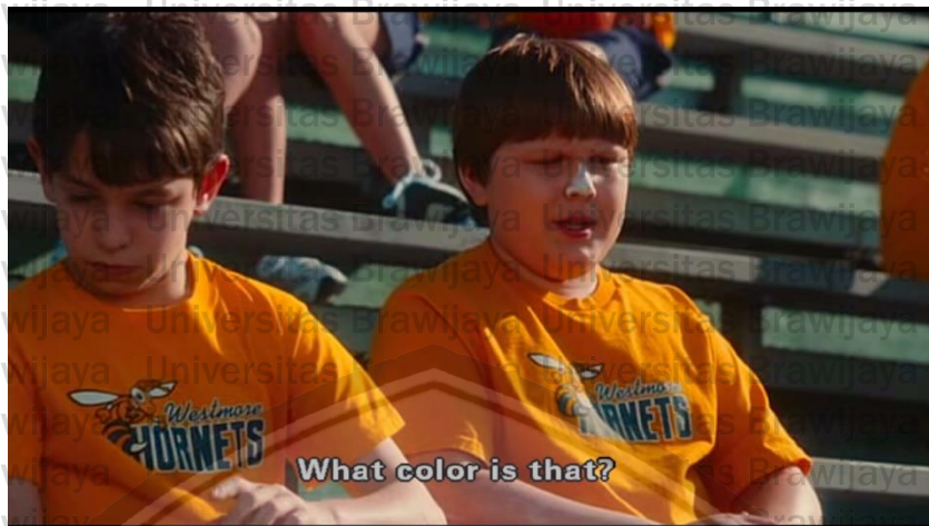
Figure 3.1.3 Avoid seeing Fregley’s freckle by moving and looking to another side.

(Source: Diary of a Wimpy Kid , 2010, minute 00:08:58)